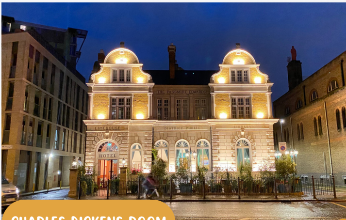
CHARLES DICKENS ROOM

The accommodation will take place at our boutique concept hotel, Limehouse Library Hotel London , which started its service in 2022 after being renovated from a historic public library. Our hotel is conveniently located for easy access to the city center . Each room offers a unique atmosphere dedicated to historically significant figures. We provide an opportunity for each guest to experience the distinctive character of their room, feeling the privilege of viewing life from that room. Don't miss the chance to explore together!