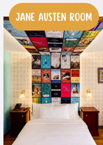
JANE AUSTEN ROOM