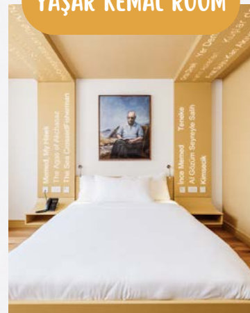
YAŞAR KEMAL ROOM